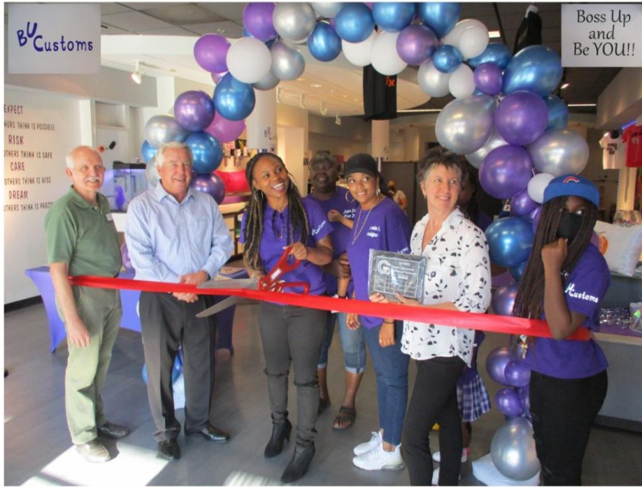
Greater Casa Grande Chamber of Commerce / Ribbon Cutting ~ September 7, 2021