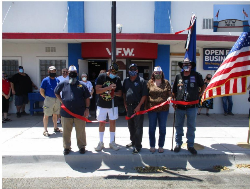
Greater Casa Grande Chamber of Commerce / Ribbon Cutting ~ August 1, 2020